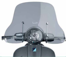
GTS / GTS SUPER / GTS SUPER SPORT cod. 675048