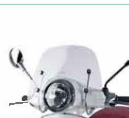
PRIMAVERA cod. 1B001213