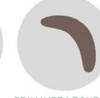
PRIMAVERA TOURING BROWN cod. CM273106