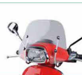
SPRINT cod. 1B001245