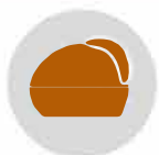
ARANCIO TRAMONTO CM272923