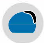
BLU GAIOLA 1B00001600DQ