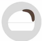
BIANCO INNOCENZA 1B00001600BR