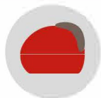
ROSSO PASSIONE 1B00001600R7