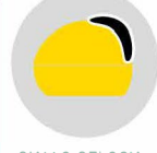
GIALLO GELOSIA cod. CM272924