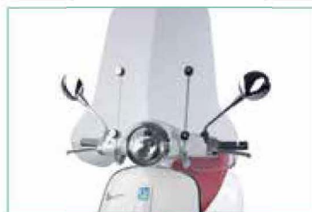
PRIMAVERA cod. 1B001215

Painted top box, with backrest covered using the same material and finish as the saddle. Fresh, modern design complementing the soft, flowing forms of the Vespa. It can hold one flip up helmet or two jet helmets.