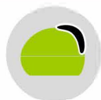
VERDE SPERANZA CM272921