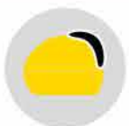
GIALLO POSITANO 1B00001600L5