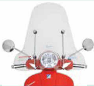
GTS / GTS SUPER / GTS SUPER SPORT cod. 623880

Vespa clear flyscreens are superior quality impact-resistant methacrylate. This medium sized shield offers effective protection and complements the style of the vehicle.