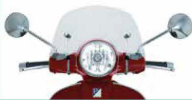
GTS / GTS SUPER / GTS SUPER SPORT cod. 1B001810