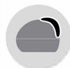
GRIGIO TITANIO cod. CM272912