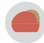
ROSA CORALLO CM272922

*PRIMAVERA AND SPRINT WILL NEED A FIXED RACK TO MOUNT THE TOPBOX. 1B000815 - CHROME REAR RACK OR 606002M - BLACK REAR RACK FOR ALL THE BIKES