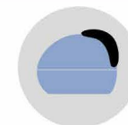
AZZURRO INCANTO CM272920