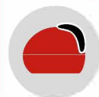
ROSSO PASSIONE 1B00001600R7