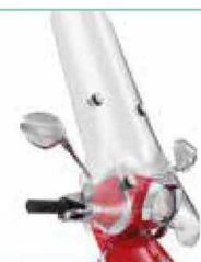
SPRINT cod. 1B001243