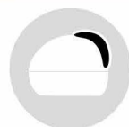
BIANCO INNOCENZA 1B00001600BR